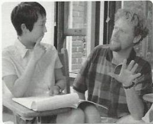
▲ 3. Studying in a foreign country