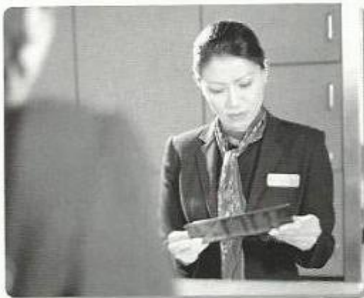
▲ 1. An airline representative

1 Discussing Second and Foreign Languages What are the advantages of learning a second language? Look at the photos and answer the questions that follow.