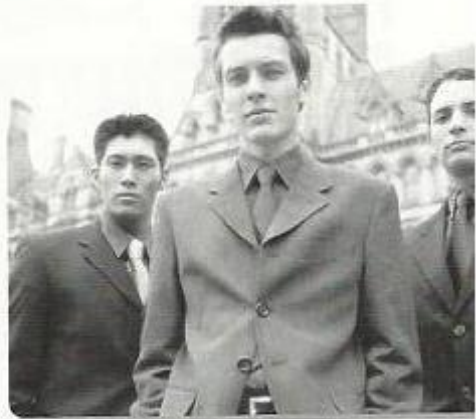
▲ 2. Doing business in a foreign country