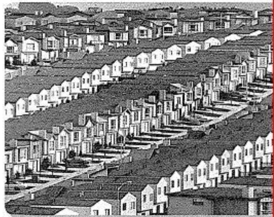
▲ A suburban community in the United States

We live in an ordinary house on an ordinary street in an ordinary suburb, and I think it is terrific! Our house is now about 30 years old, but it looks newer. I used to live in apartments, first in Florida, and then in New Mexico. But I prefer living in our own home. My house is like hundreds of other houses in the suburbs, one story with an attached garage. There is nothing special about the house, and it won't win any prizes for architecture, but it's perfect for our family. The kitchen is big and has new appliances, including a beautiful new dishwasher and a microwave oven. I don't like the heat, but we have air conditioning in the living room and bedrooms, so it is always cool. I don't know why some people I know don't like the suburbs. For the kids, there's a nice yard where they can play. It's very safe, so my wife and I don't have to worry. I am very thankful that we can afford this house and live our ordinary lives in it.