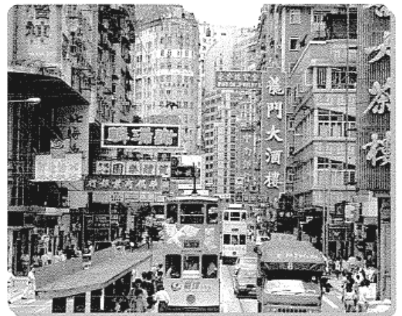
▲ Hong Kong's neighborhoods are lively.