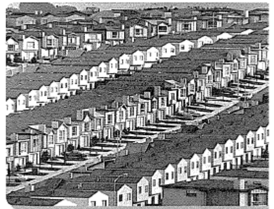
▲ A suburban community in the United States

We live in an ordinary house on an ordinary street in an ordinary suburb, and I think it is terrific! Our house is now 30 years old, but it looks newer. My house is like hundreds of other houses in the suburbs, one story with an attached garage. There is nothing special about the house, and it won't win any prizes for architecture, but it's perfect for our family. The kitchen is big and has new appliances, including a beautiful new dishwasher and a microwave oven. I don't like the heat, but we have air conditioning in the living room and bedrooms, so it is always cool. For the kids there's a nice yard where they can play. It's very safe, so my wife and I don't have to worry. I am very thankful that we can afford this house and live our ordinary lives there.