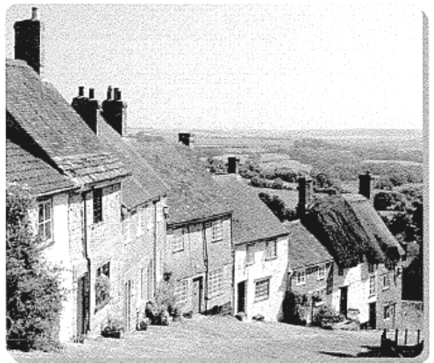
▲ Some villages in Europe don't change much over time.