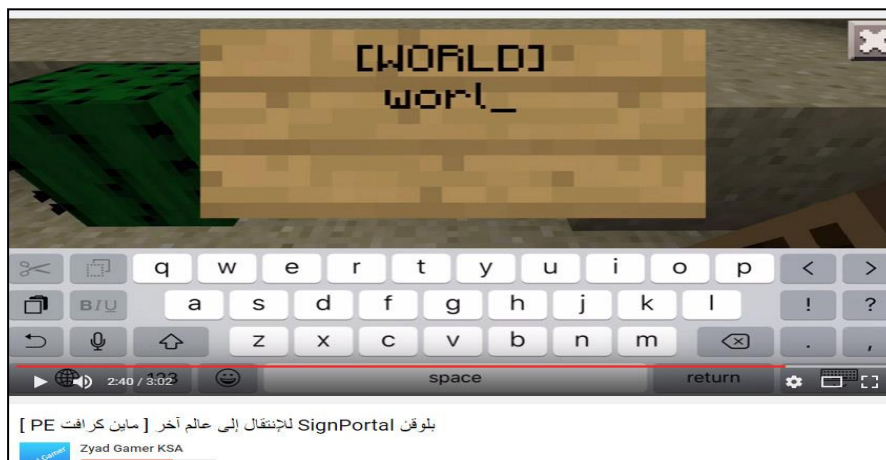
(A Saudi user using in-game tools to type an english word "world")

Also this game can improve the user typing skills by typing to correct words to the correct stuff he is hording or stashing, so his friends knows whats this and what's that when they visit his virtual world