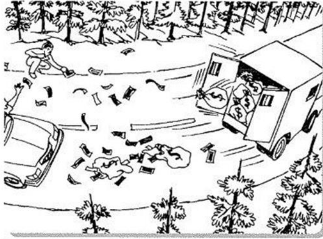
▲ An armored truck spilled bags of money on Interstate 71.

COLUMBUS, OHIO. October 28 was a fortunate day for motorists driving along Interstate 71 at about 9:30 in the morning. As a truck from the Metropolitan Armored Car Company sped down the highway, its back door blew open, and bags of money fell onto the road. When other vehicles hit the bags, the bags split open, spewing over a million dollars all over the highway.