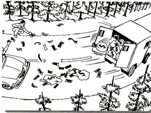
▲ An armored truck spilled bags of money on Interstate 71.

COLUMBUS, OHIO. October 28 was a fortunate day for motorists driving along Interstate 71 at about 9:30 in the morning. As a truck from the Metropolitan Armored Car Company sped down the highway, its back door blew open, and bags of money fell onto the road. When other vehicles hit the bags, the bags split open, spewing over a million dollars all over the highway.